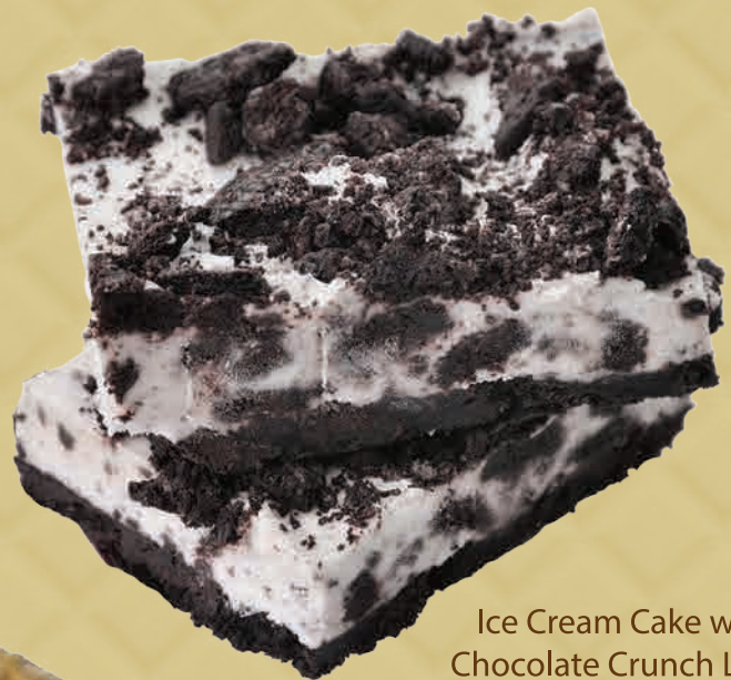
Ice Cream Cake with Chocolate Crunch Layer