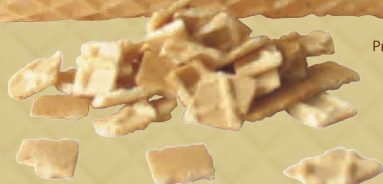
Premium Waffle Pieces

BoDeans Baking Group 1790 21st St. SW LeMars, IA 51031 1-866-BoDeans (263-3267)